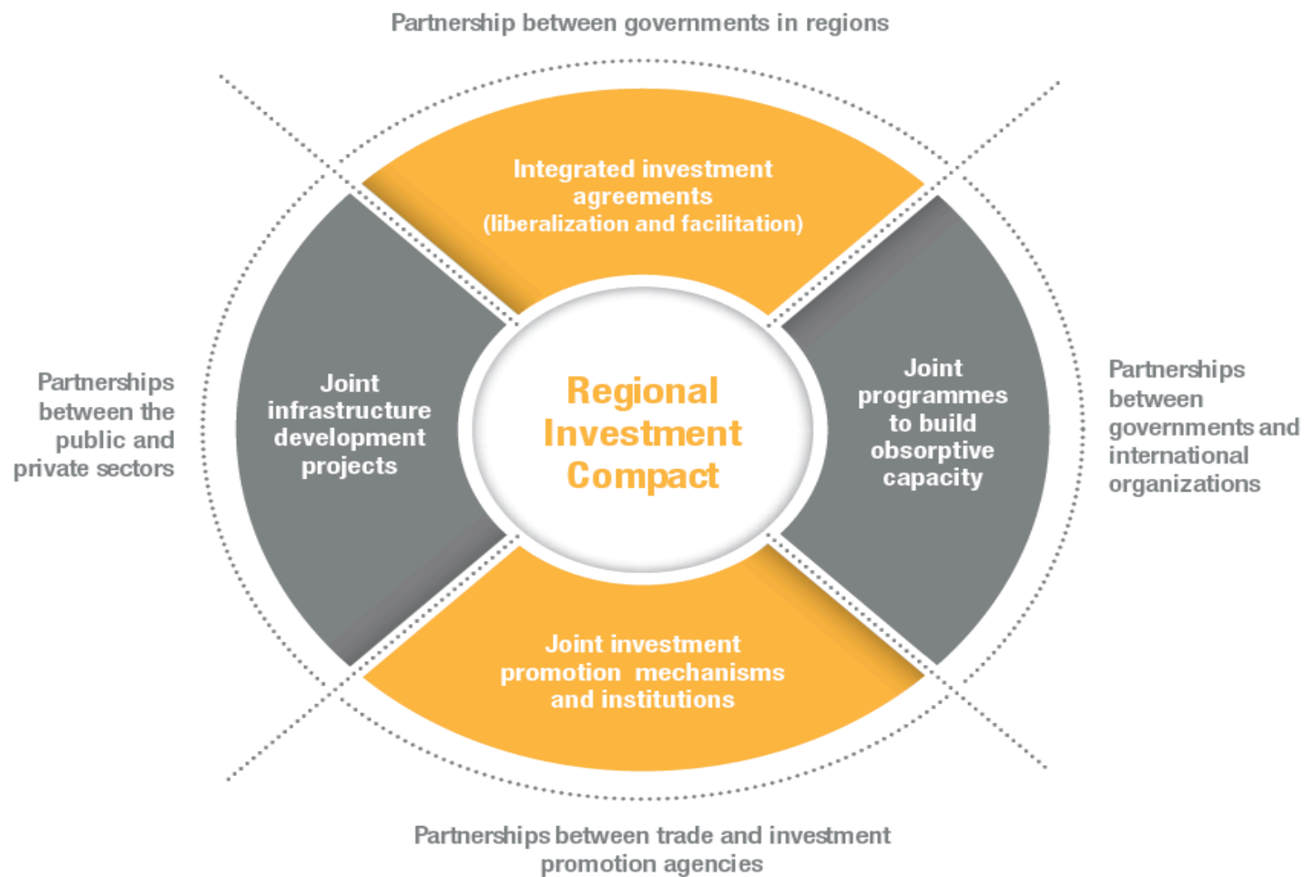
Figure 2. Regional Investment Compacts